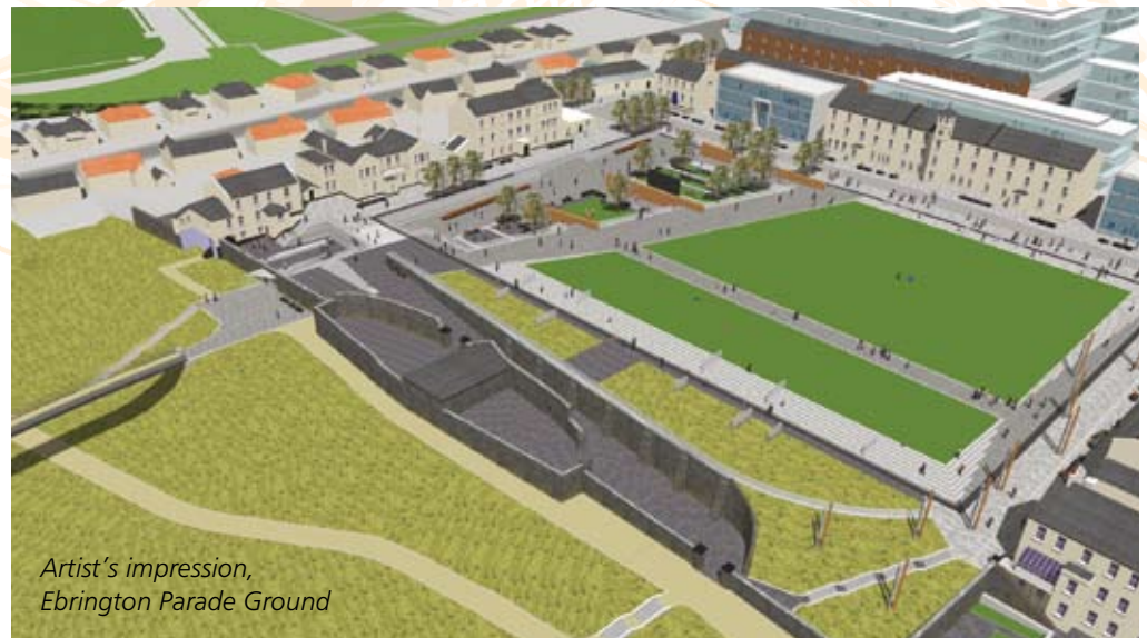
Artist's impression, Ebrington Parade Ground