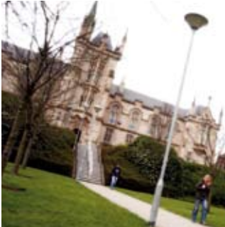
University of Ulster, Magee

As the regional capital of the North West of Ireland, Derry~Londonderry offers investors a cosmopolitan and diverse business, social, cultural and leisure environment .